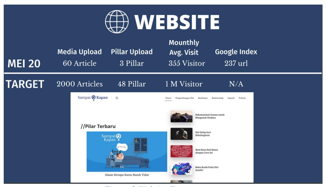
Figure 2 Website Engagement rate

Once we have been providing our content through Instagram, we have broadened our idea to use another platform instead of only using Instagram, then we build a website in the middle of April and we have gained 300 visitor in one month.