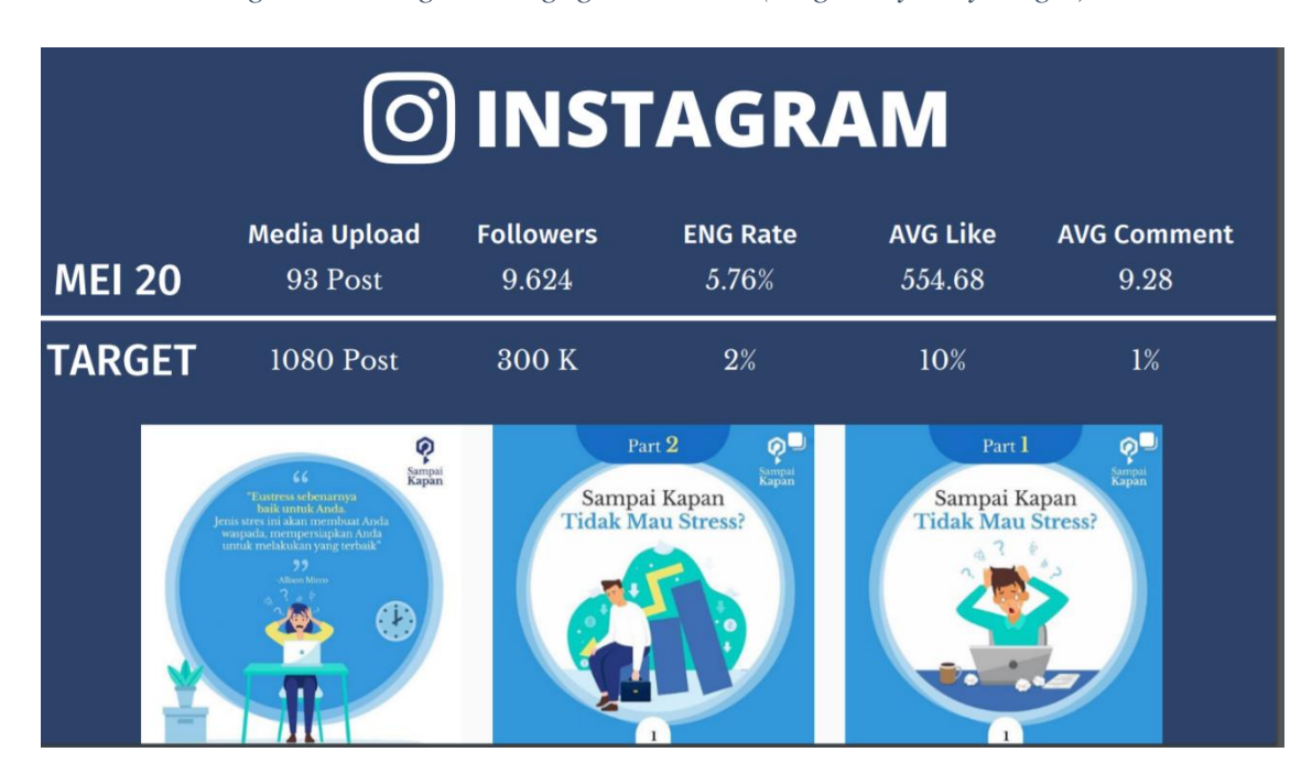
Figure 1 Instagram Engagement Rate (target is yearly target)

Once we have been providing our content through Instagram, we have broadened our idea to use another platform instead of only using Instagram, then we build a website in the middle of April and we have gained 300 visitor in one month.